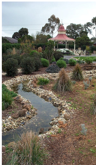
Mambourin Sensory Garden

Mambourin Enterprises is a not for profit organisation which supports people with disabilities by providing employment and day programs.