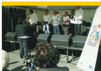
Opening the Footscray 150 year Festival 18 July 2009

Choir: The choir was established by Fou in 2006. The choir is about fun, confidence, self-esteem and friendships. Also developing and achieving goals and ability to stand up in front of an audience and perform live. A piano was donated to Altona Site 2000 and was transferred to Sunshine Site in 2004. The piano has enabled the Choir members to co-write their own songs and work as a group to complete song-writing.