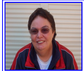
Recipe Chosen and typed by Deborah T

Heat olive oil in large saucepan; cook onion and garlic, stirring, until soft but not browned. Add potato, cauliflower, stock and water, bring to a boil; simmer, covered, until vegetables are very soft. Blend or process cauliflower mixture until smooth. While blending the mixture, you find the soup too thick, add hot water or milk for more flavour until you bring the soup mixture to your desire.