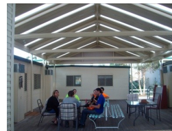
Enjoying Lunch 2011